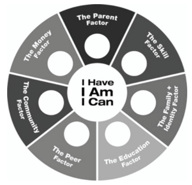
Figure 1. The Resilience Doughnut framework

The Resilience Doughnut model is a simple diagram of two circles, one inside the other, which conceptually represents the interaction of these internal characteristics and external contexts in developing resilience. The model is based on the definition that resilience is a process of continual development of personal competence while negotiating available resources in the face of adversity.